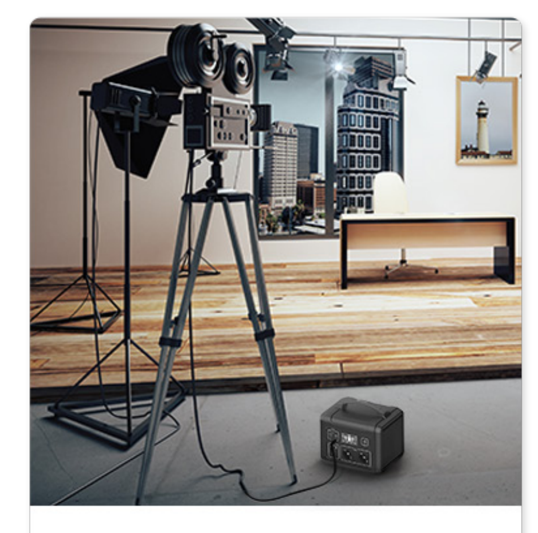
Power your creative filming projects