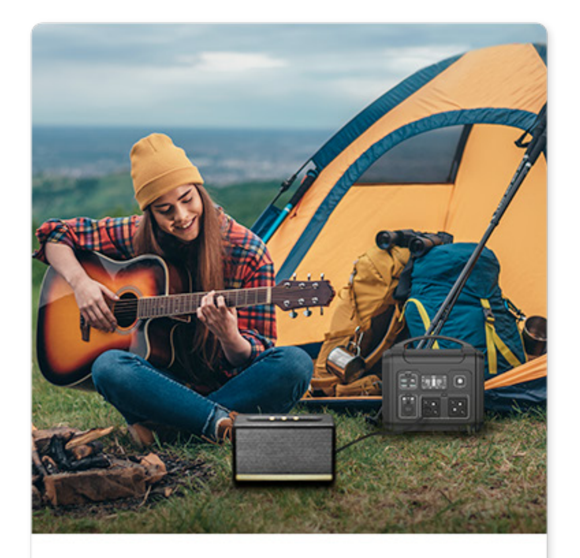
Plan road trips with enough power