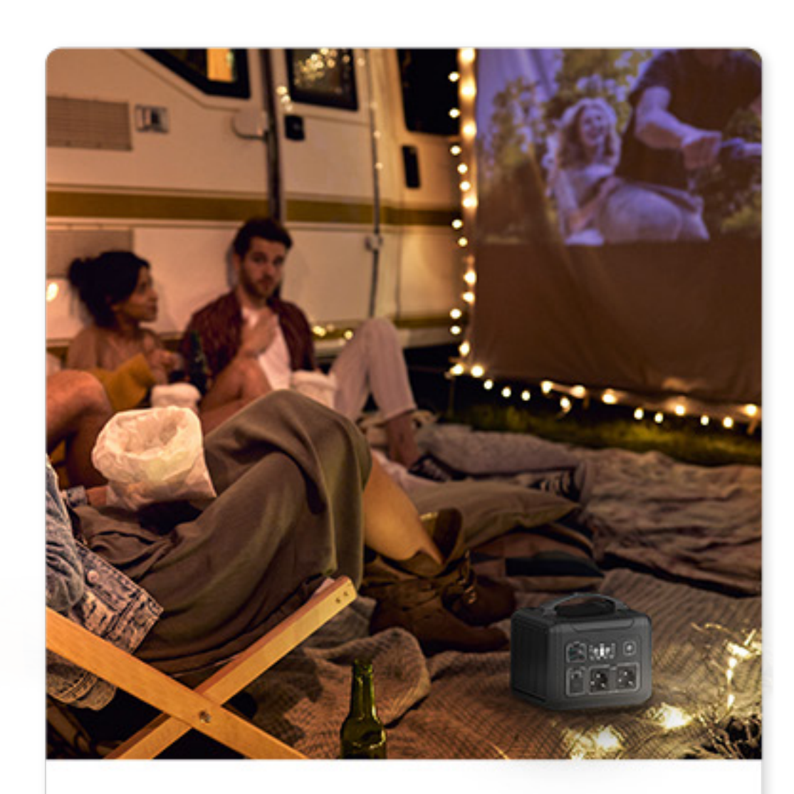
Enjoy the outdoors just like home